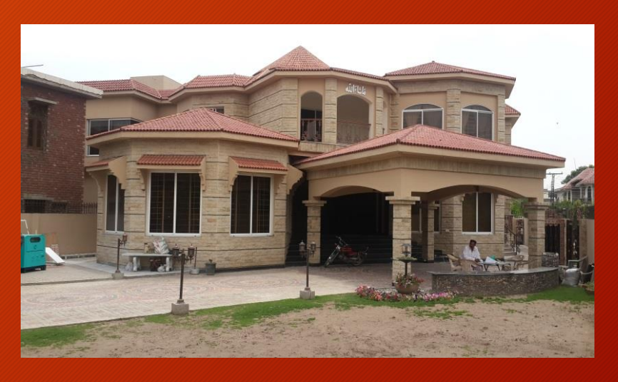
130 A at canal view Lahore

Site Analysis Schematic Design Services Topographic survey Construction Document Services Construction Contract Administration Service Post Construction Services Renovation of existing building Structural design health and safety design